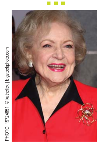
HAPPY 90TH BIRTHDAY TO BETTY WHITE!

BETTY WHITE / ELKA OSTROVSKY HOT IN CLEVELAND